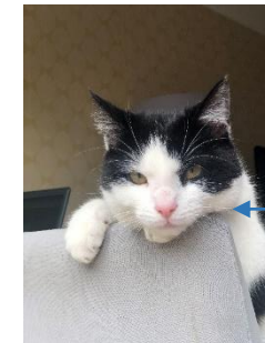
This is Bombo